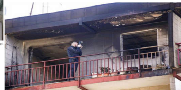
Incendio en un piso de El Vendrell (Tarragona) donde murieron cuatro hermanos de entre 4 y 12 años en 2014. JOSEP LLUÍS SELLART